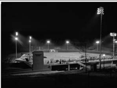
▲ GRAY-MINOR STADIUM CENTER FOR LEADERSHIP & ETHICS ▼

The facilities necessary to provide an education that thoroughly prepares cadets to meet the challenges of the 21st century are far more complex than they were in 1839. Vision 2039 aims to maintain the historic atmosphere of the Post as it develops the modern, technologically advanced facilities that VMI needs to prepare cadets for lives of success, service, and leadership.