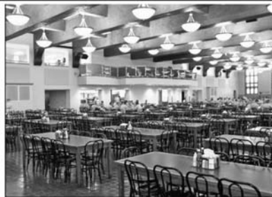
ALUMNI MEMORIAL FIELD AT FOSTER STADIUM ▼ CROZET HALL ▲